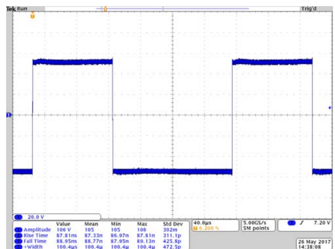
+50 V & -50 V, 4 kHz, 100.4 \mu s, 344 pF Load

For sales information or technical questions contact your local IXYS representative or IXYS Colorado directly at: